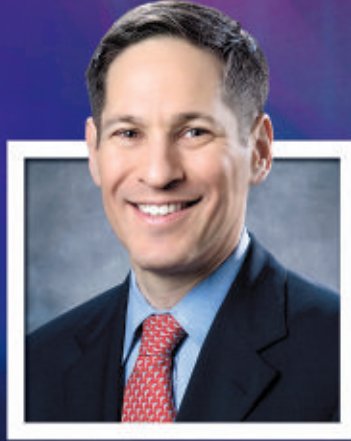
DR. THOMAS R. FRIEDEN Centers for Disease Control and Prevention 5B